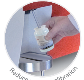
Reduce your Recalibration