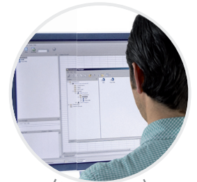
User is notified